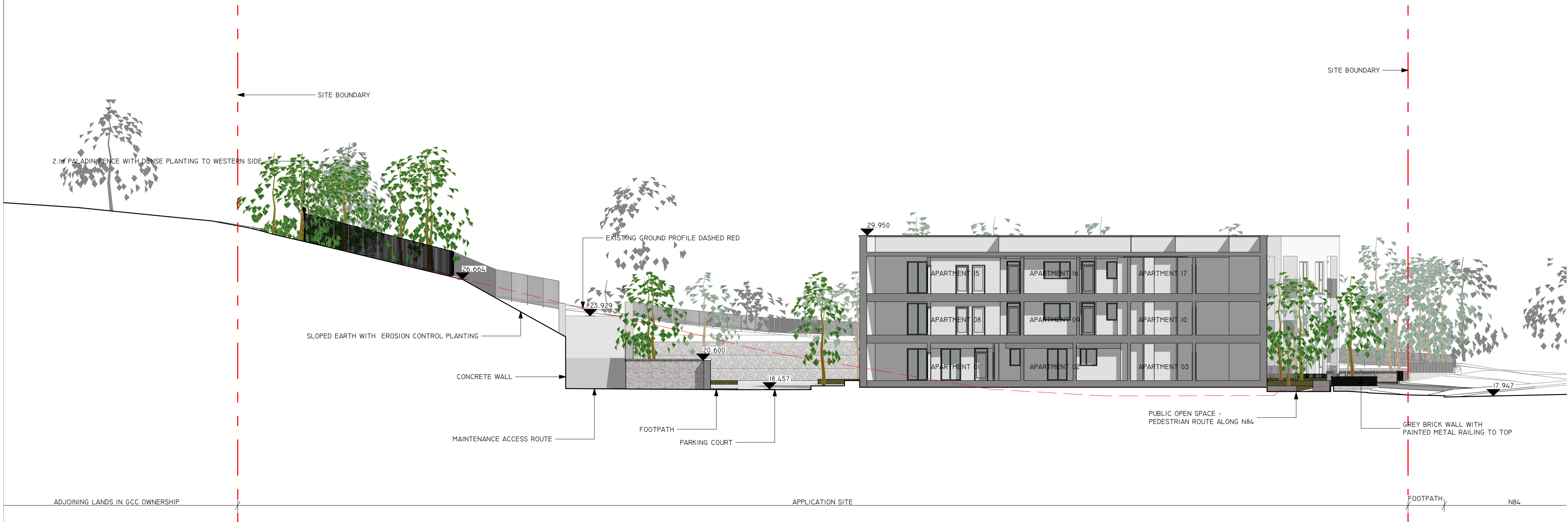
03 SITE SECTION 03 PI01 1:200